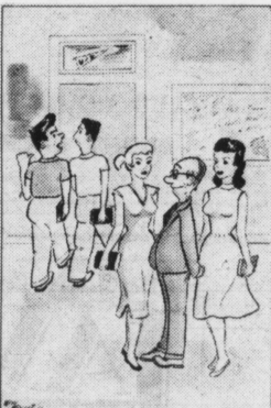
We're sunk—he grades on the curve!

The fly is considered the worst insect to the human being.