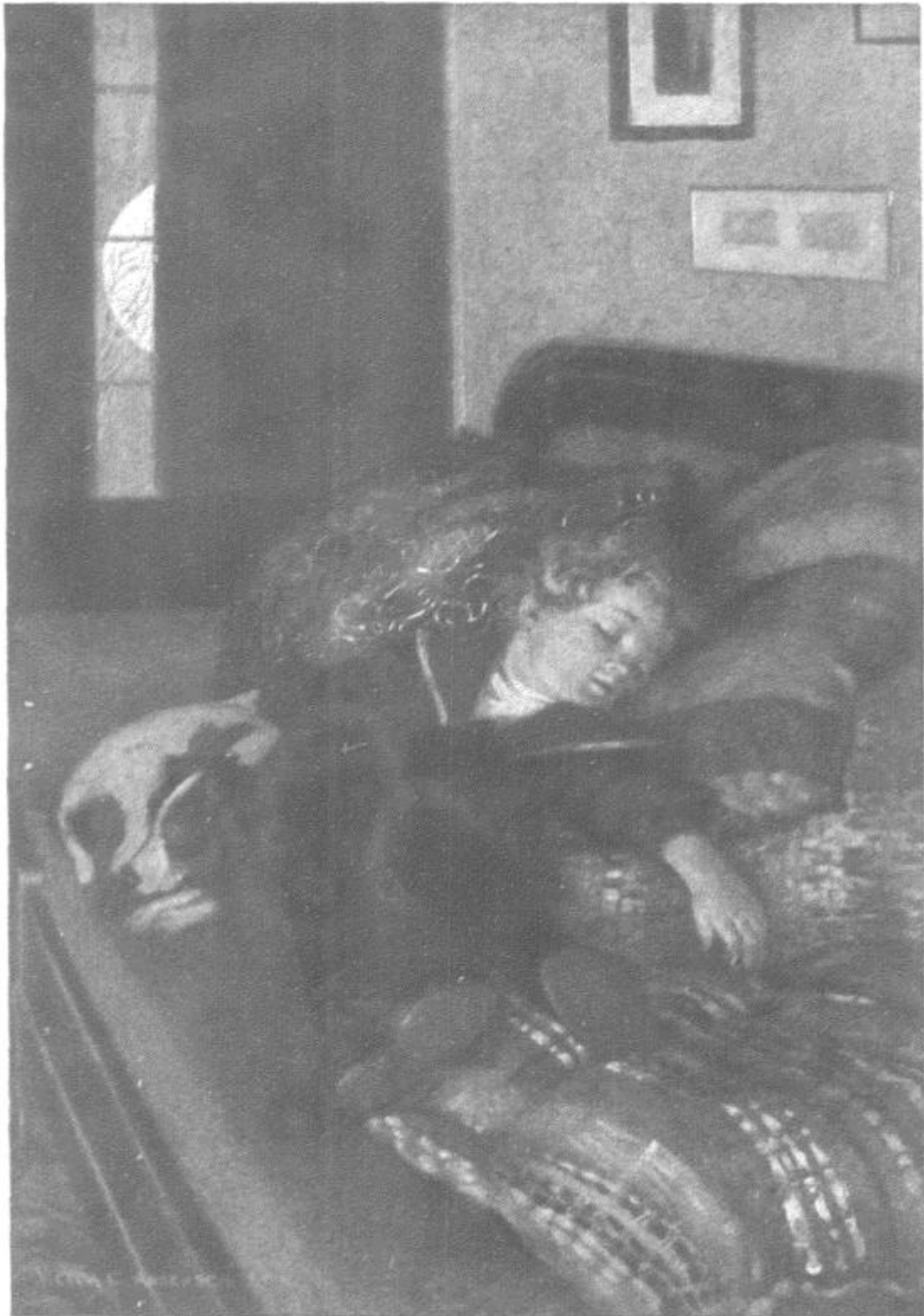
As wide awake as a boy could be who had made up his mind to keep awake until midnight.