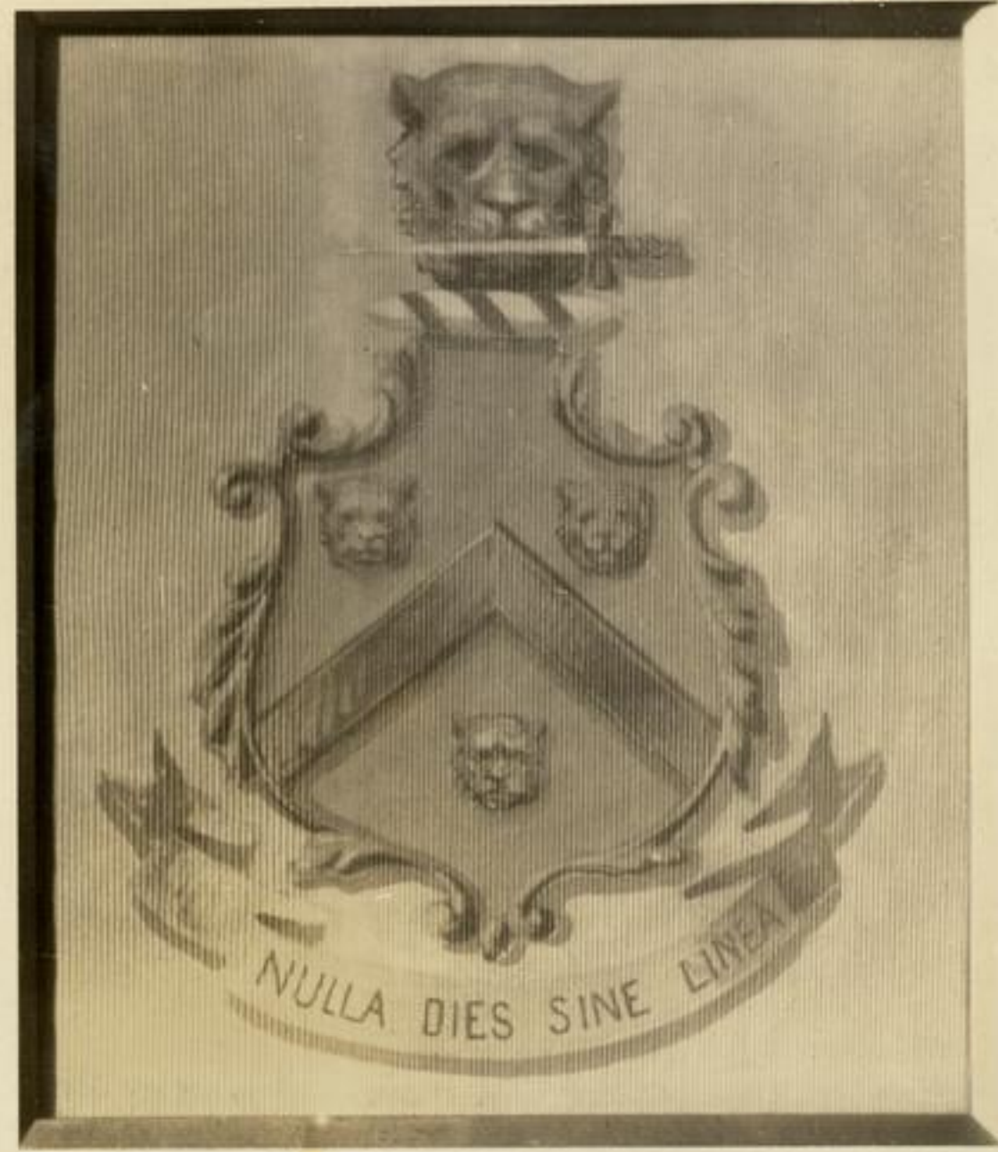
Fitch Coat of Arms

Frank Fitch and family were living on East Main, Mt. Sterling, at the time of Grandmother's death. She left a 2 months old baby, Harold, who died a few months later (1875)