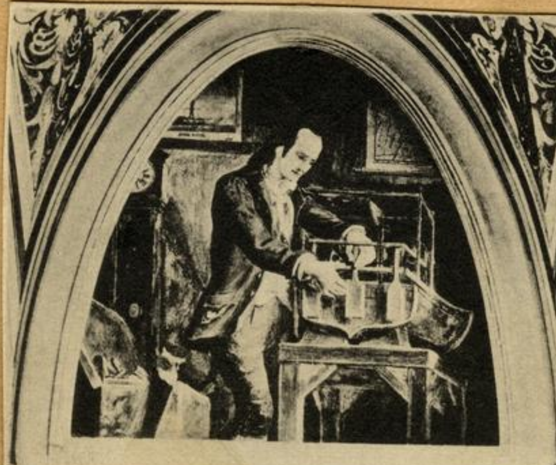
Fresco painting of Lieutenant John Fitch in the U. S. Capitol, Washington, D. C. He was born January 21, 1743, in South Windsor, Conn. He invented the steamboat in 1785 and in succeeding years operated several commercial boats, including the Perseverance I, of 1790, on the Delaware River. He died July 2, 1798, in Bardstown, Ky.