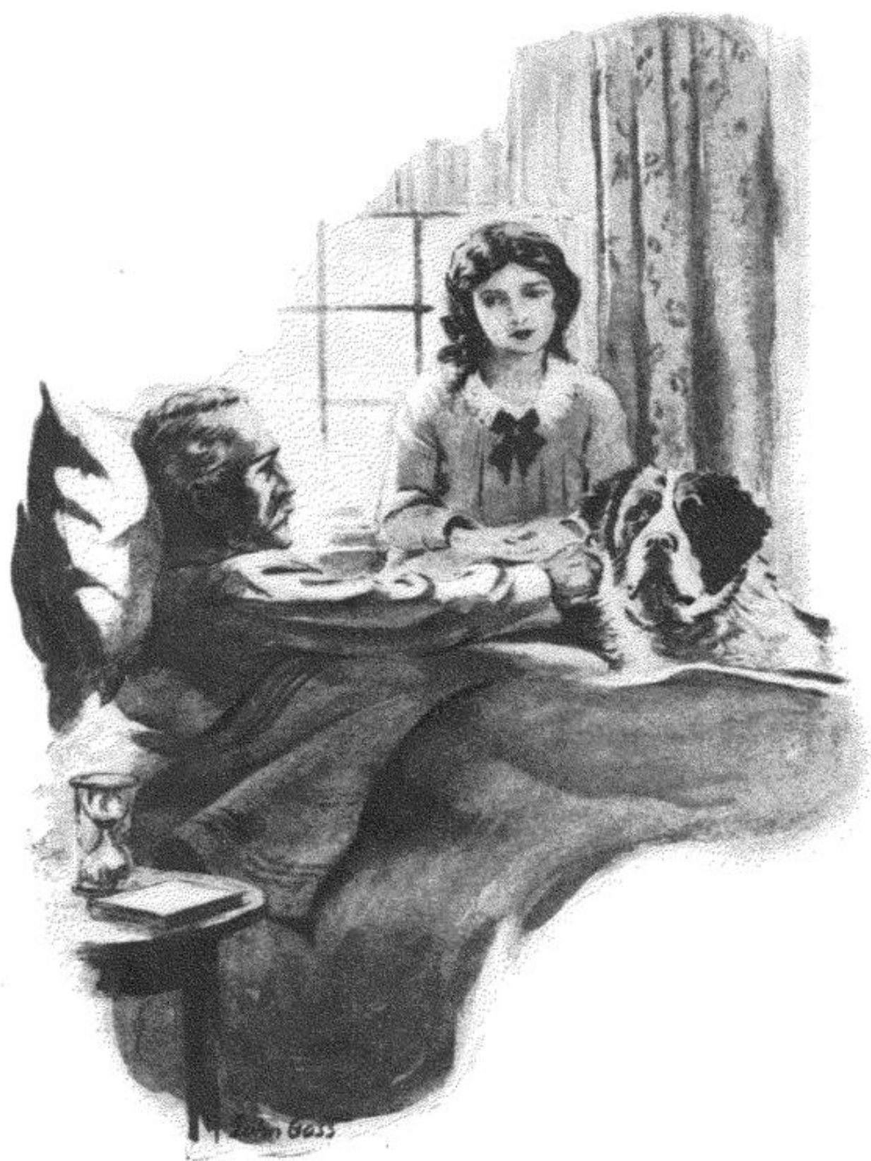
“ HE FASTENED THE MEDAL TO HERO’S COLLAR ”