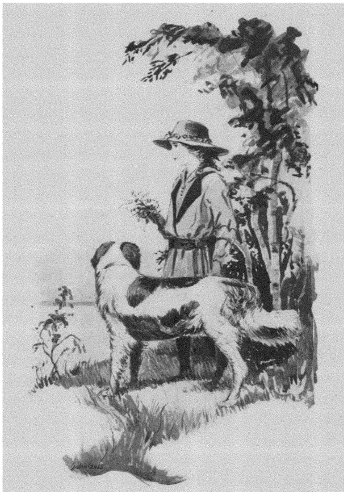
“ THE TWO WERE WANDERING ALONG BESIDE THE WATER TOGETHER ”