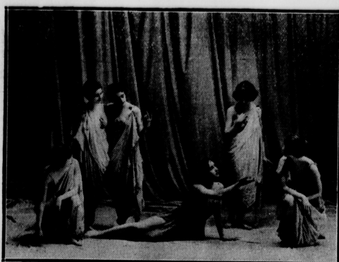
Isadore Duncan Dancers

Suits made by us pressed for one year free of charge.