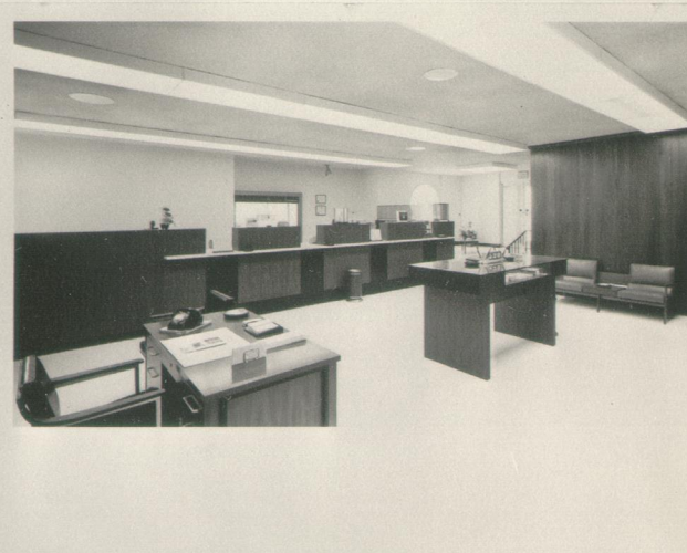
DRIVE-IN BRANCH BANK INTERIOR VIEW COMPLETED 1966 NICHOLASVILLE ROAD LEXINGTON, KENTUCKY 1,450 Sq. Ft. $112,839.00 OWNER: CITIZENS UNION NATIONAL BANK & TRUST CO.