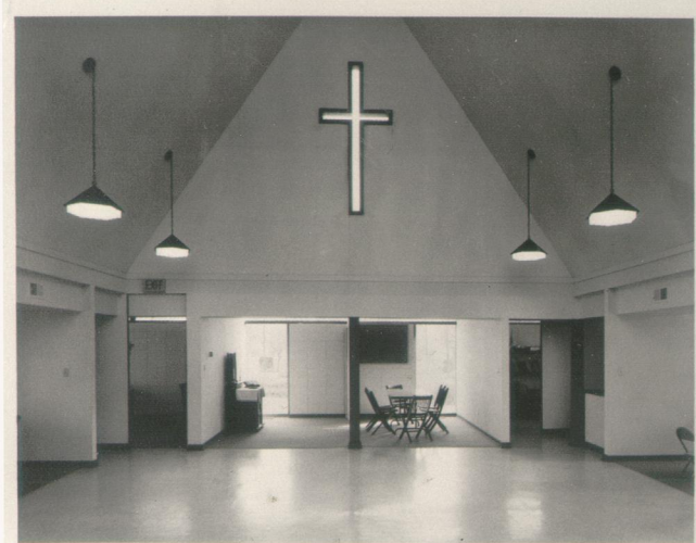
PARISH HALL, HOLY TRINITY METHODIST CHURCH INTERIOR VIEW COMPLETED MAY 1967 GEORGETOWN, KENTUCKY 5,610 Sq. Ft. $75,000.00 OWNER: HOLY TRINITY EPISCOPAL CHURCH