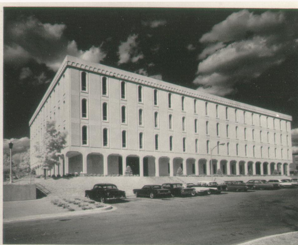
BERT COMBS CLASSROOM BUILDING EXTERIOR VIEW COMPLETED OCTOBER 1965 EASTERN KENTUCKY UNIVERSITY RICHMOND, KENTUCKY 137,075 Sq. Ft. $2,358,432.00 OWNER: COMMONWEALTH OF KENTUCKY