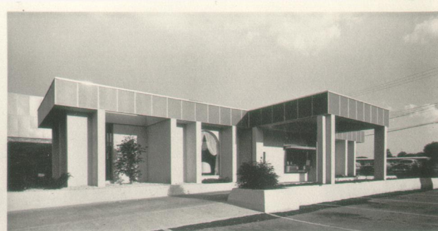
DRIVE-IN BRANCH BANK EXTERIOR VIEW COMPLETED 1966 NICHOLASVILLE ROAD LEXINGTON, KENTUCKY 1,450 Sq. Ft. $112,839.00 OWNER: CITIZENS UNION NATIONAL BANK & TRUST CO.