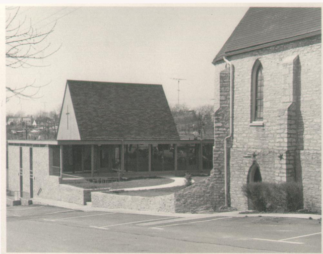
PARISH HALL, HOLY TRINITY EPISCOPAL CHURCH EXTERIOR VIEW COMPLETED MAY 1967 GEORGETOWN, KENTUCKY 5,610 Sq. Ft. $75,000.00 OWNER: HOLY TRINITY EPISCOPAL CHURCH