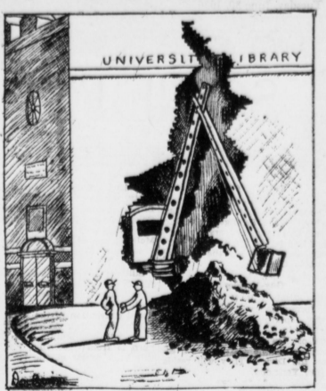
"I'm sorry sir, I fell asleep while working on that Central housing plant."