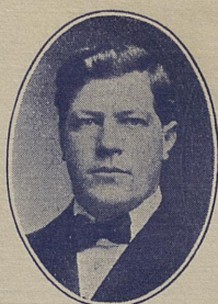
DALTON BROS. OWNERS AND MANAGERS