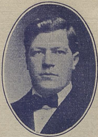
DALTON BROS. OWNERS AND MANAGERS