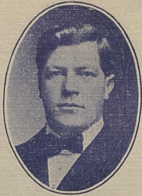
DALTON BROS. OWNERS AND MANAGERS