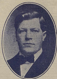
DALTON BROS. OWNERS AND MANAGERS