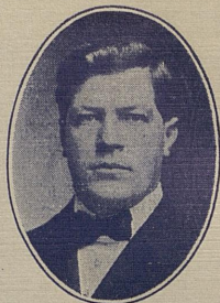
DALTON BROS. OWNERS AND MANAGERS