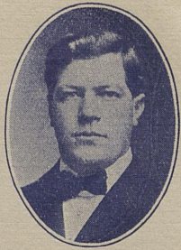
DALTON BROS. OWNERS AND MANAGERS