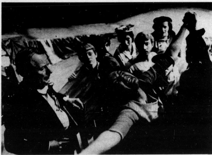
Dark Of The Moon