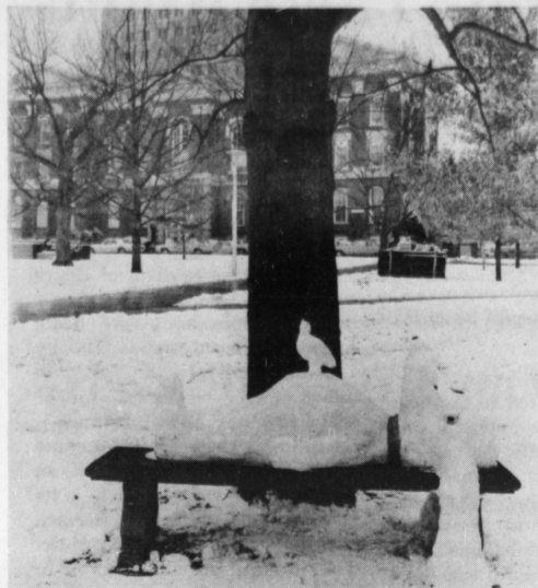
Hang On Snoopy

Contemplating life, the Peanuts philosophy and the coming ball season, "Our Hero" Snoopy lies peacefully on a campus bench after the weekend's wintry blasts. He had more than the pesky ice bird on his chest to worry about, however, Tuesday, as the sun came out to change snow dogs to puddles.