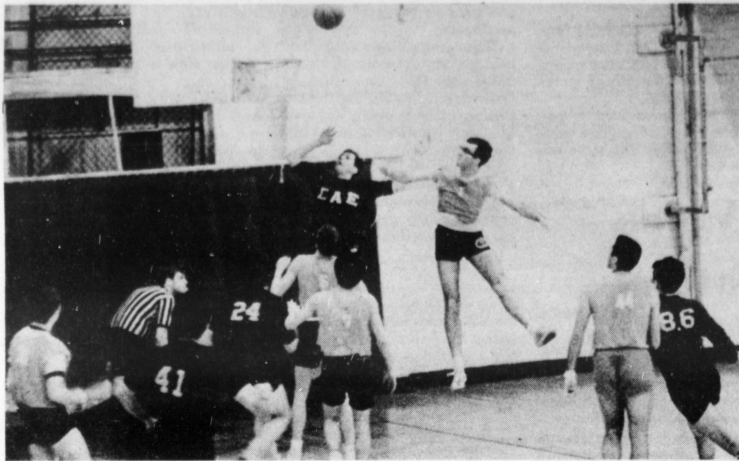
Kernel