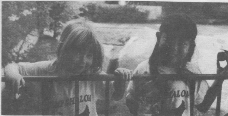
"Made new friends!"