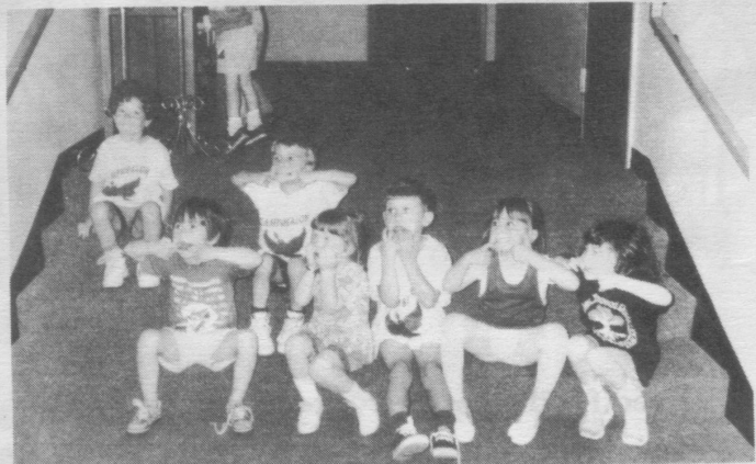
"Loved the counselors!"