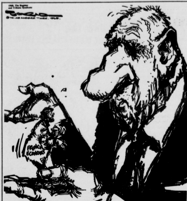
'It Was A Question Of Devaluating Either You Or The Franc ...'

YAF has made a move, and it is to be commended. There are a lot more groups on campus that need to follow in their decision to act rather than to complain.