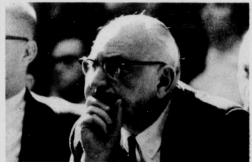
It's The Time Of Year For 'Rupp Jokes.'