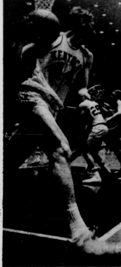
ISSEL—He's hitting his foul shots as average rises.

Issel's 10 free throws helped his point production reach 22 as