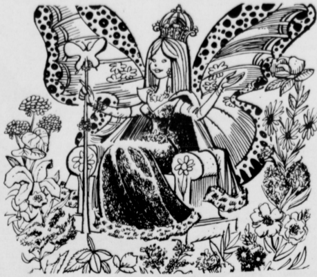
The Queen was a creature of breathless beauty.

The water was greener, the sky bluer, the sun brighter than anyone could ever have imagined. And the flowers! Jessamine and hawthorne. Marigolds and lady-slippers. Violets and daisies. Name any flower — it was there in Butterfly Kingdom.