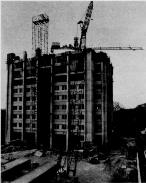
UK's Classroom-Office Complex

Tomorrow: Kentucky State College, Western Kentucky University and Murray State University.