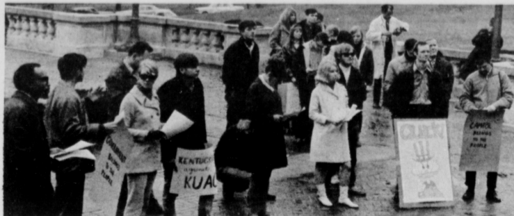
A "guerrilla play" performed on the steps of the Capitol in Frankfort Tuesday attacked the Kentucky Un-American Activities Committee (KUAC), the sales tax and coal mining operations. The play was put on by members of Kentuckians against KUAC, the UK SDS chapter, CARSA and the University of Louisville Students for Social Action. The play labeled "QUACK" as being "illegal and illegitimate."