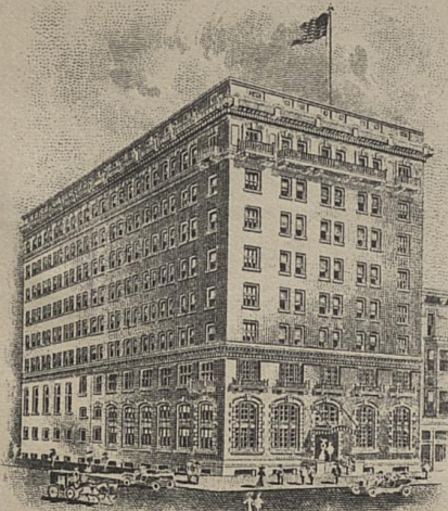
COURIER-JOURNAL LITH. LOUISVILLE

ONLY FIRE PROOF HOTEL IN CENTRAL KENTUCKY.