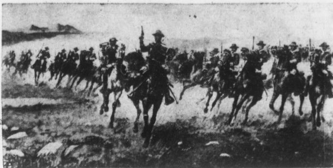
Have You Seen It?

If you see the missing painting, one Remington characteristic should be readily apparent: the lead horseman should appear ready to spring to life and escape from the canvas. This is an effect he achieved in many paintings.