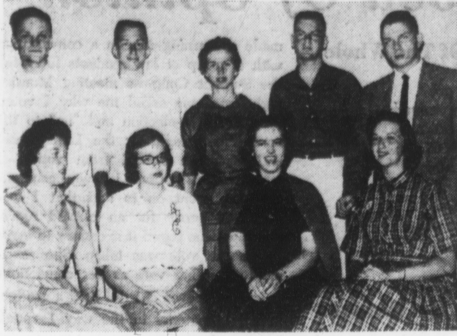
New SuKy Officers