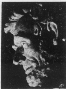
Implicated in the recent Student Congress election fraud was . . .