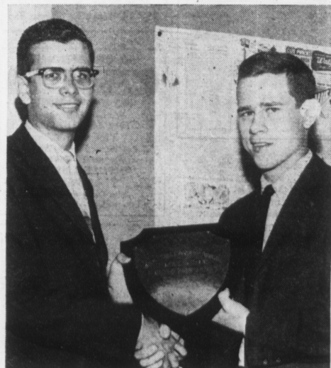
Keys Trophy Awarded