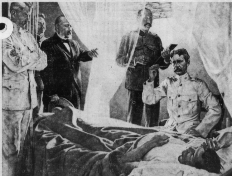
Med Center Paintings

A series of 42 oil paintings depicting "A History of Medicine in Pictures" will be shown during the month of February at the University Medical Center. Among the paintings which depict important events in medicine from about 1500 B.C. is this representation of the discovery of the spread of yellow fever virus by mosquitoes from investigations by Major Walter Reed.