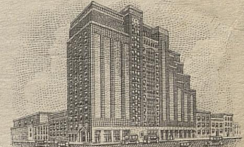
80TH STREET BUILDING