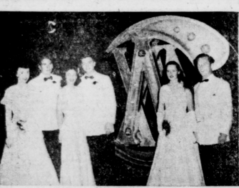
Epilion Phi Zeta of Lambda Chi Alpha fraternity entertained with its first annual dance Saturday night May 8, in the Flaxent Hotel ballroom.