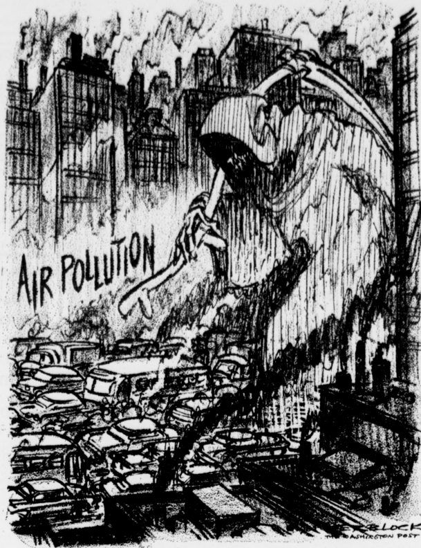
The Gray Plague

Such appearances add tremendous dignity to the founding of our University and provide significant insight into the concepts of our world leaders. It is unfortunate there was no such opportunity this year.