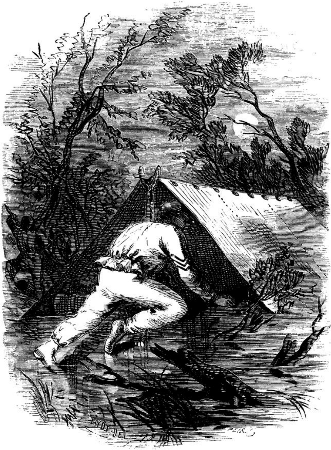
THE "DOG TENT."