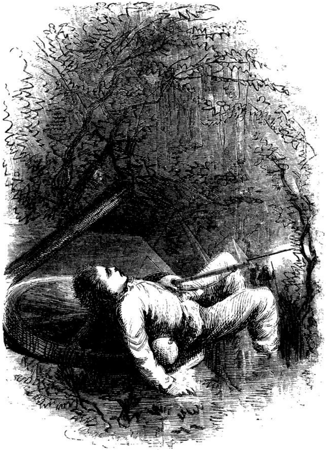
THE SOLDIER'S BED.