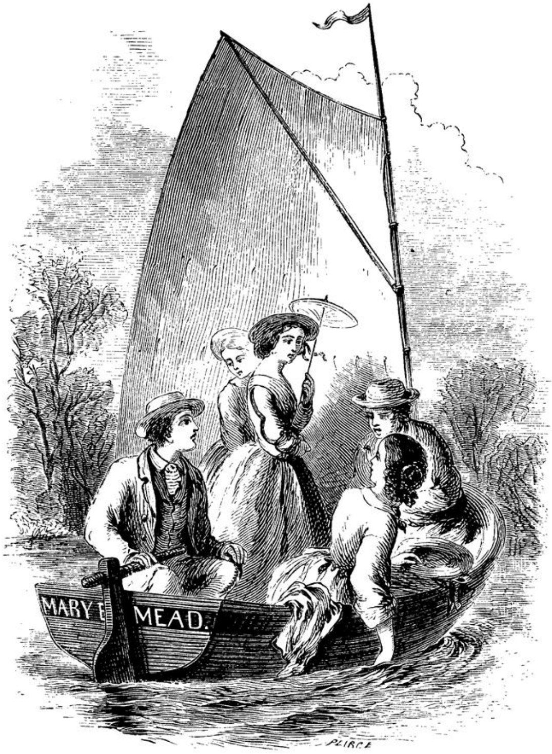
THE PLEASURE BOAT.