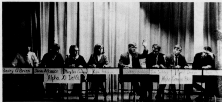
The Alpha Xi Delta Quiz Bowl team, left, defeated Alpha Gamma Rho, right, Tuesday night after winning a playoff match with Spectre.

Delta Gamma forfeited to Phi Kappa Tau because the proper substitute was not present.