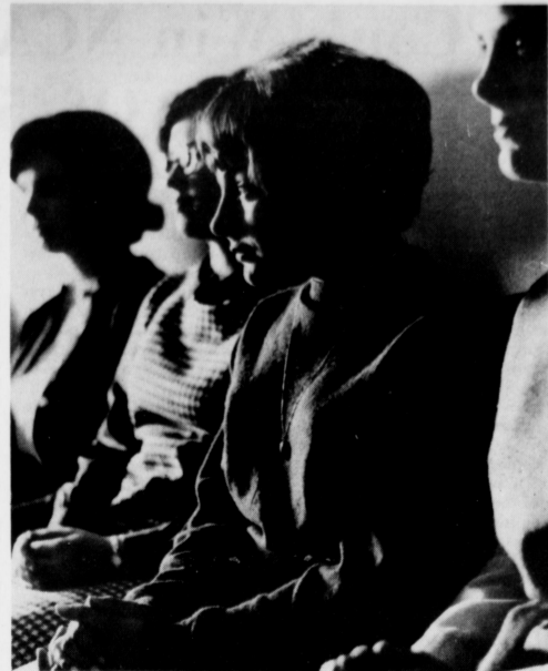
Church Attendance—An Afterthought