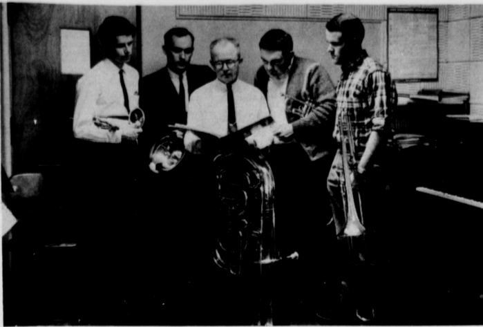
Members of the Faculty Brass Quintet are shown at 8 p.m. in Memorial Hall. The concert is free going over the music they will perform Thursday and open to the public.