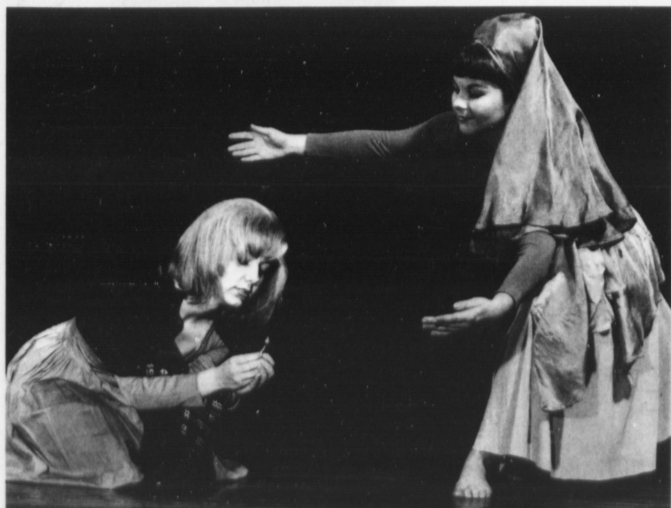
The Virgin Mary And The Little Match Girl