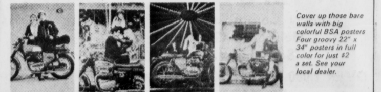
Cover up those bare walls with big colorful BSA posters. Four groovy 22" x 34" posters in full color for just $2 a set. See your local dealer.

Silky smooth BSA Starfire is easy going as a lightweight can be—but take off the wraps and watch it come alive! Here's the best of all worlds, the light touch for tooling around campus plus the big punch for open road excitement. BSA big frame features like these make the difference: high performance alloy engine... four stroke single cylinder o.h.v. power... four speed constant-mesh gearbox... multiple clutch. If you've got a yearning for a lightweight that acts twice its size, step up to Starfire. See your local dealer for details and full color illustrations of all the new BSA models for 1968—250 Starfire / 441 Victor / 441 S.S. / 650 MK IV / 650 Thunderbolt / 650 Lightning.