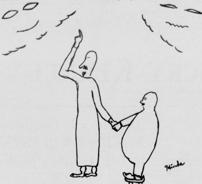
'Sancho, My Great White Whale Is A Sty In The Devil's Eye.'

The Brown Theatre has scheduled six Broadway hits with Broadway stars after "Man of La Mancha" closes this week. Maybe Kentucky will find out what's happening.