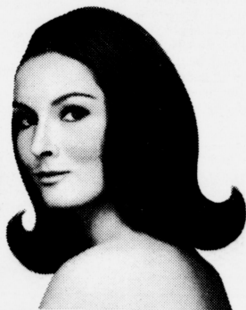
Refillable purse-size too.