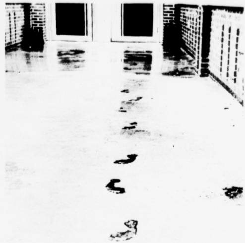
Call Of The Wild?

Edgar Rice Burroughs had Tarzan cultured, Oxford variety, but maybe the ape man has decided to get a sampling of economics, College of Commerce style. From the direction he's tracking, though, looks like the lord of the jungle got his fill of UK.