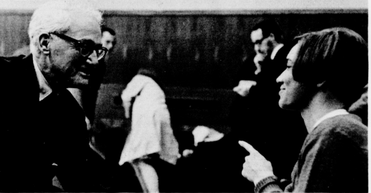
Kernel Photo by Bill Gross