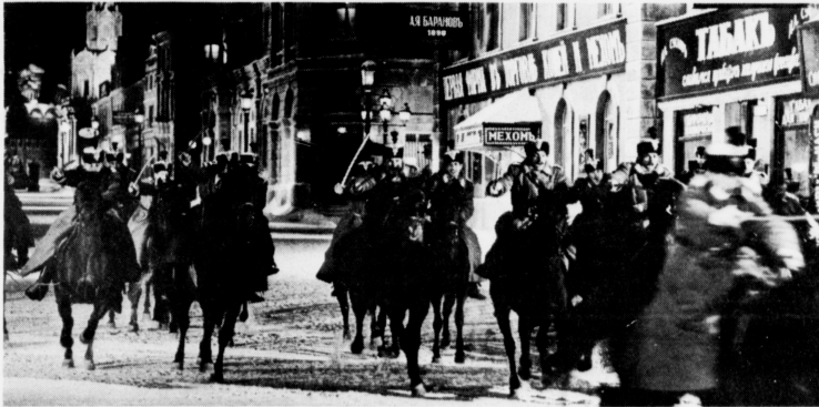
Mounted Dragoons make a brutal charge against demonstrators on a set from David Lean's film "Doctor Zhivago" which opens Thursday night at the Kentucky Theater.