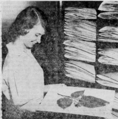
Another Plant For My Herbarium