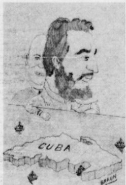
LISTEN, YANKEE — We don't harbor Khrushchev's boats.