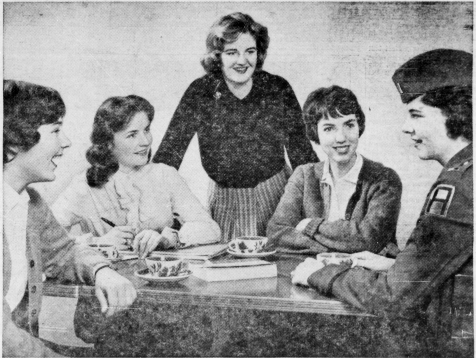
PHOTOGRAPHED AT MARYMOUNT MANHATTAN COLLEGE, N.Y.C.