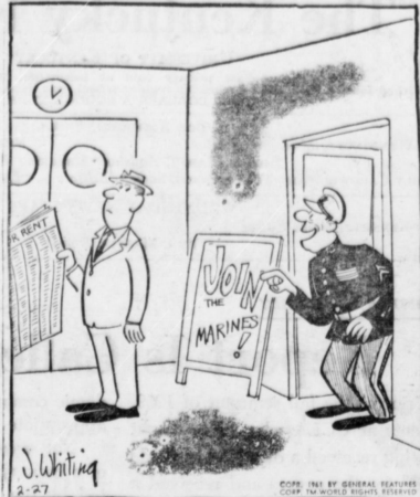
"Hey, Buddy — you looking for room and board at real reasonable rates?"