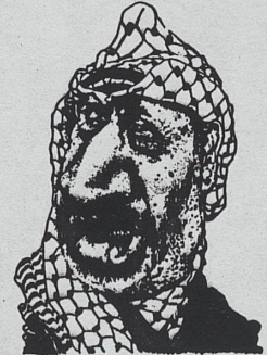
FLO Chairman Yasser Arafat