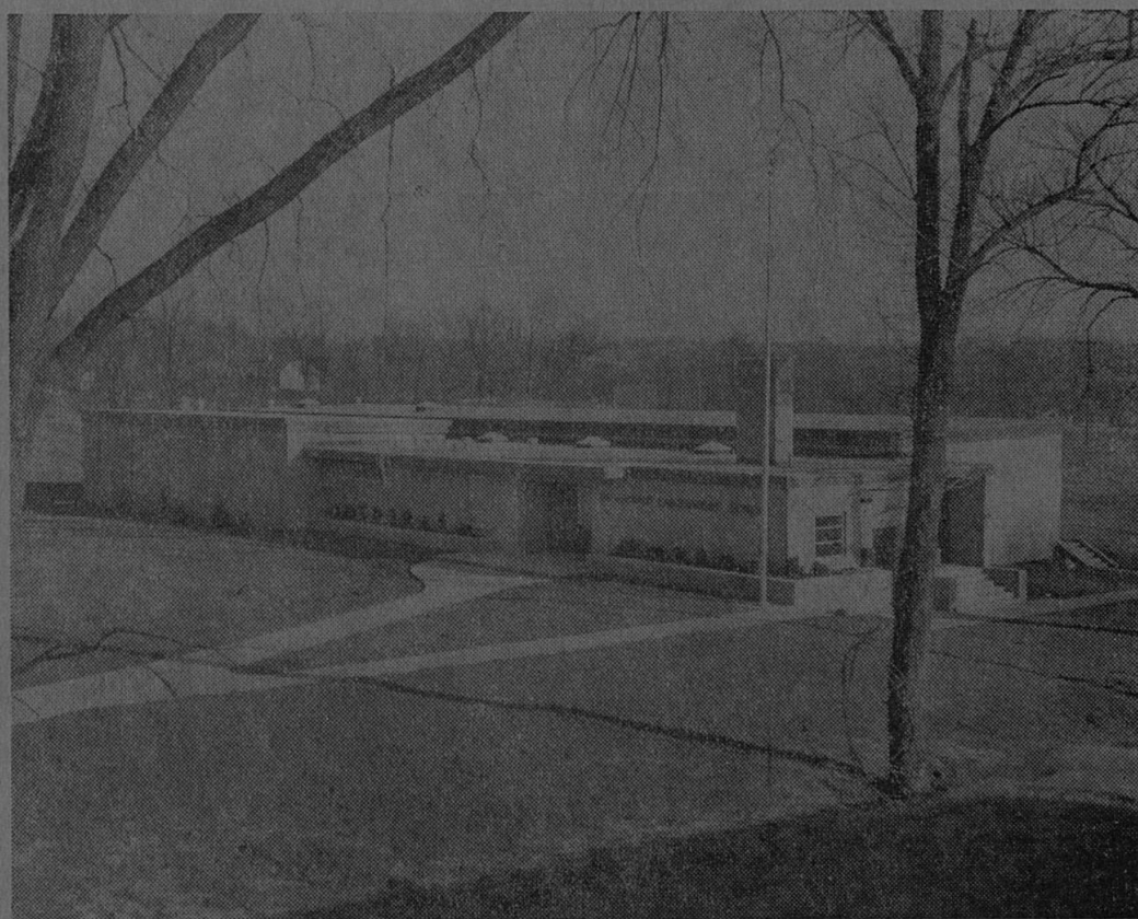
Rosenwald Laboratory School, Kentucky State College

"An Equal Educational Opportunity for Every Kentucky Child"