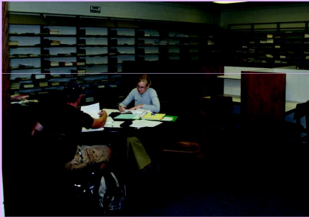
Above: The old unbound periodicals section. Right: The new unbound periodicals section known as "The Hall of Deans."

The overcrowded unbound periodicals section has been modified into a more accessible area with low shelving and now includes portraits of past College of Engineering deans, commonly referred to as the "Hall of Deans." Lastly, the standards, which once occupied a large bathroom in the back, are now neatly arranged in magazine boxes in reference. And the infamous bathroom? It was divided into two smaller ones: a women's and a men's. Even better, they have (gasp) toilets and sinks--and even soap and towels! Hooray!!!