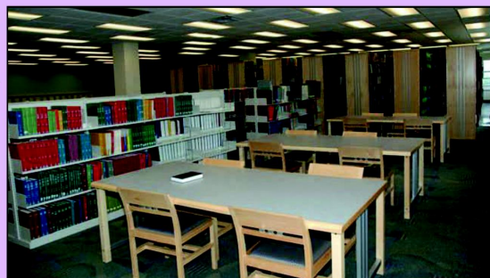
New reference study area.

Under Jenn Esqew’s supervision and planning, the students were responsible for most of the physical labor, which included sending materials off to storage, which included the boxing, un-boxing, re-boxing, and tracking of hundreds of books and serials while keeping the library in a usable condition as users continued to come in despite the chaos. Every day furnishings for the new library arrived. As they were put into place the previous furniture was sent to surplus or passed on. The work continued in relative darkness for several weeks while construction crews wired in new lighting, sprinklers, and electrical systems. Next came new carpet and paint, and lastly the furniture was assembled.