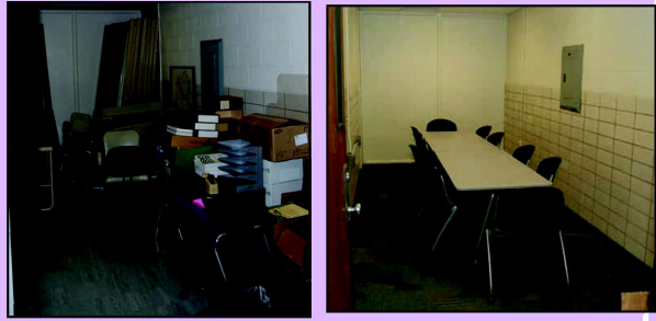
L to R: Old office space, new office/meeting room.

Over a few months the library was transformed. A dark back hallway is now a bright corridor. A once junk-filled storage room is now a private team study and meeting room. The dark laminates have been replaced with solid maple materials. The old office will soon be a small computer room for library instruction and engineering projects. There is a new circulation desk which is large and open to accommodate all of our reserves and supplies as well as provide plenty of room for student worker tasks. We've even installed a social area for people who want to study in a comfortable chair or use one of the new laptop-friendly chairs or benches.