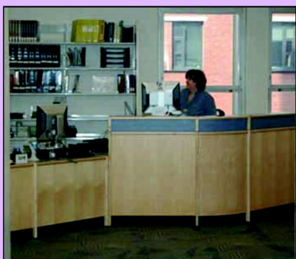
New Circulation Desk

Major renovations were completed in the Engineering Library this past Spring and Summer. Since the first day of Fall Semester, one of our favorite pastimes in the library is to see the astonished faces of our regular users as they come in the bright new entrance. One morning, at the beginning of the semester, a young man with a messenger bag in one hand and a motorcycle helmet in the other walked through the door and raised his hands from his sides in a gesture of ecstatic astonishment. Because of the drastic change, many people wonder if they are in the right place.