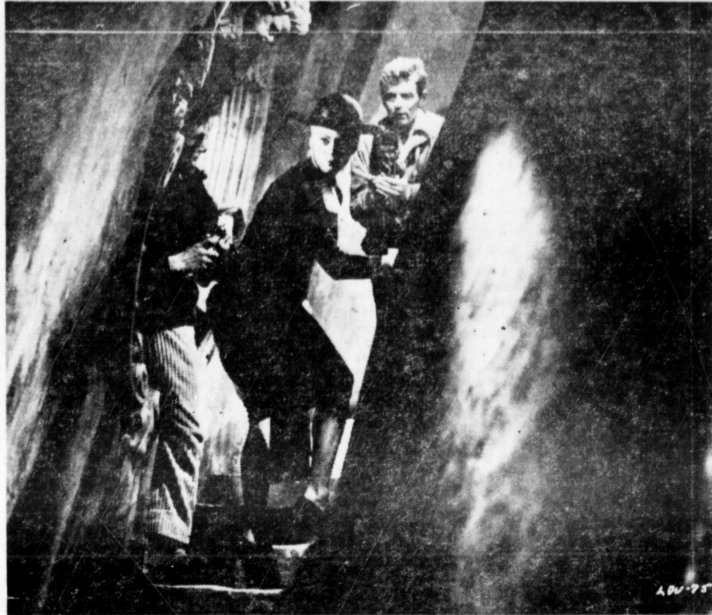
This scene is symbolic of the grotesqueness of the controversial Italian film, "La Dolce Vita." The motion picture is a study of the decadent nobility,

Lorraine Hansberry successfully compiled the life and problems of a minority people caught in the realms of a majority people. A motion picture which exceeds the admission.