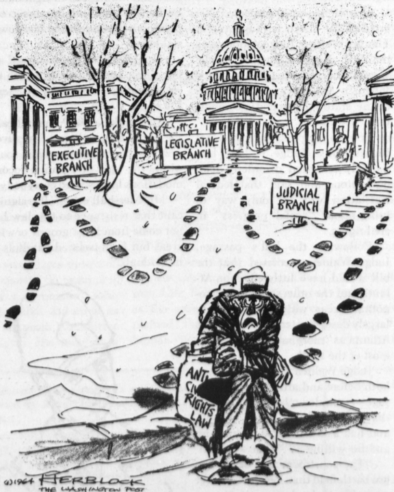
It's A Hell Of A Note—No Accommodations For Me!