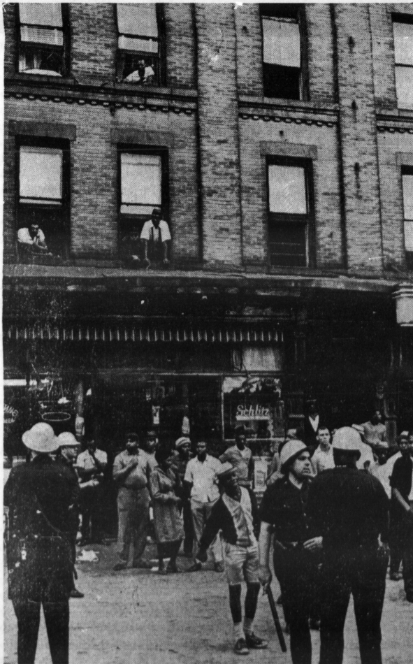
SULLEN BROOKLYN CROWDS PEER AT POLICE AFTER RIOTING

Black Muslims look with complete disgust upon Negroes fighting for integration. The Muslims do not want integration. They wish to escape with their own people to their own little section of the world.