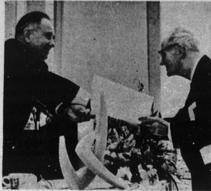
—The Lexington Leader

Special comment and commentary section deals with civil rights: Begins on Page Five.