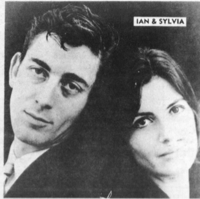
IAN & SYLVIA

Friday, Feb. 12, 8 p.m., Memorial Coliseum