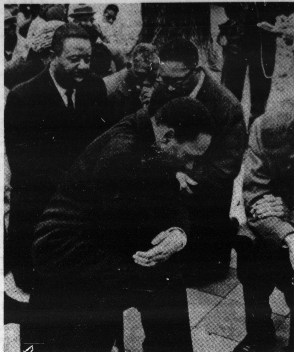
DR. MARTIN LUTHER KING JR. PRAYS IN SELMA, ALA.

ularly hard on churches—both Negro and white—calling them the "biggest hypocrites in American society."