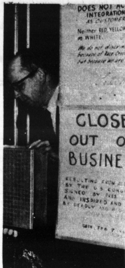
LESTER MADDOX CLOSSES UP

Then, on Sunday, a lone Negro appeared at Maddox's restaurant,