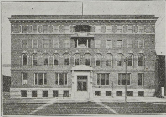
Ninth Street Branch