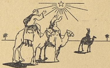
Oasis of Chicago

Menelik Temple, No. 1, A. O. K. O. and Chicago Temple, No. 1, Ladies Auxiliary requests the honor of your presence at their Reception to Visiting Knights and Ladies of the Dramatic Order of Knights of Omar at their Temple Fort Dearborn Elks Club House 3920 South Parkway Wednesday, August 17th, 1927 from 8:30 to 12 p. m.