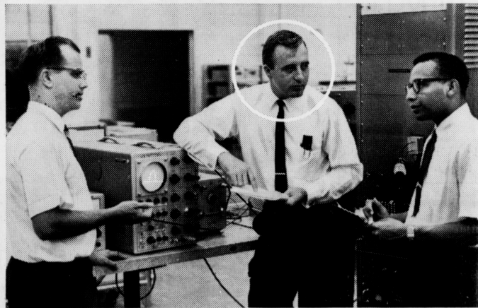
He's finding it at Western Electric