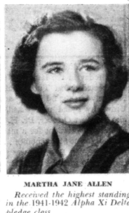
Received the highest standing in the 1941-1942 Alpha Xi Delta pledge class.