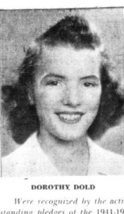
Were recognized by the actives of Alpha Xi Delta as the outstanding pledges of the 1941-1942 pledge class.

VISIT OUR NEW AUTO AND HOME SUPER MARKET B. F. GOODRICH SILVERTOWN STORE 362 E. Main Phone 393