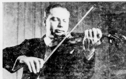
ISAAC STERN AT COLISEUM MONDAY NIGHT