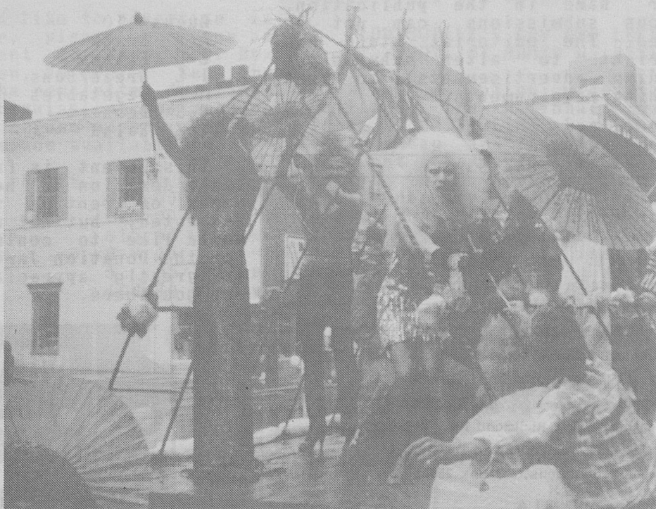
"Freedom" float, sponsored by the LMNOP, in the Fourth of July parade.