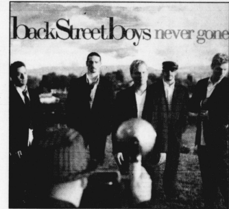
Backstreet Boys will release their newest album, Never Gone , June 14. This is the boy band's first release since 1999.

James Taylor, Carthage Milk Transplants, Haunted Cities