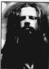
Rob Zombie will perform at Bogart's in Cincinnati on Aug. 1.

Aug. 3 3 Doors Down w/Staind and Breaking Benjamin Riverbend Music Center, Cincinnati