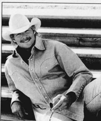
Country superstar Alan Jackson will perform Aug. 20 at Freedom Hall in Louisville.

Aug. 20 Alan Jackson Freedom Hall, Louisville