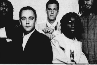
Dave Matthews Band will perform July 21 at the Riverbend Music Center in Cincinnati.

July 17 Toby Keith Riverbend Music Center Michael Buble Palace Theater, Louisville