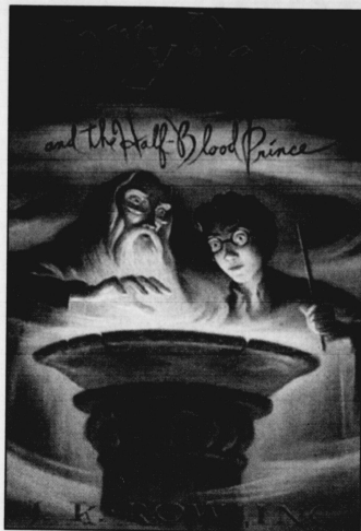
The sixth installment of J.K. Rowling's wildly popular "Harry Potter" series, "Harry Potter and the Half-Blood Prince," is released July 19.