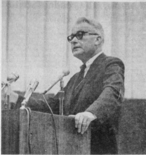
Judge Bert Combs