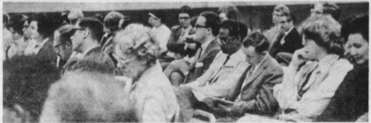
KERNEL PHOTOS BY MIMI FULLER