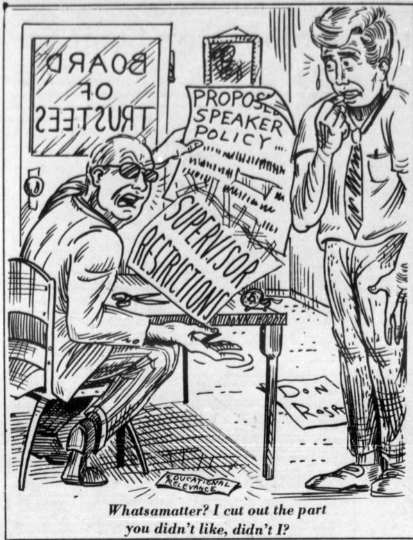
Whatsamatter? I cut out the part you didn't like, didn't I?