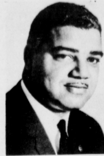
WHITNEY YOUNG JR.