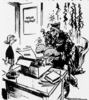
—Conrad in The Los Angeles Times "Afterthoughts on a napalm drop on a little girl's anti-war poem."

"The reasons fed to us (for doing this) are too shallow and narrow for students, as well as other citizens . . . I believe that if we had and would keep our dirty, bloody, dollar-crooked fingers out of the business of these nations so full of depressed, exploited people,