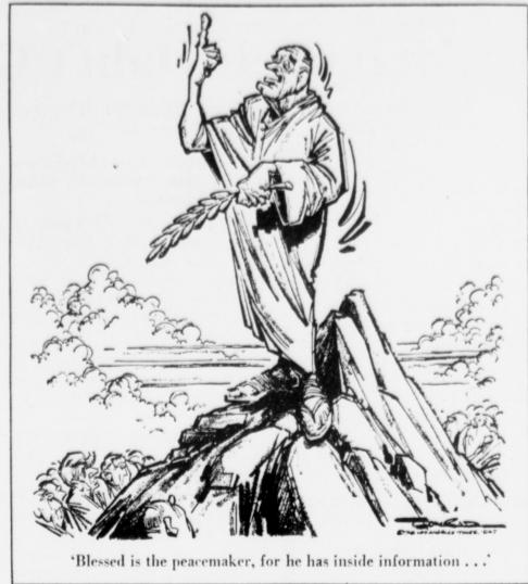
'Blessed is the peacemaker, for he has inside information . . .'