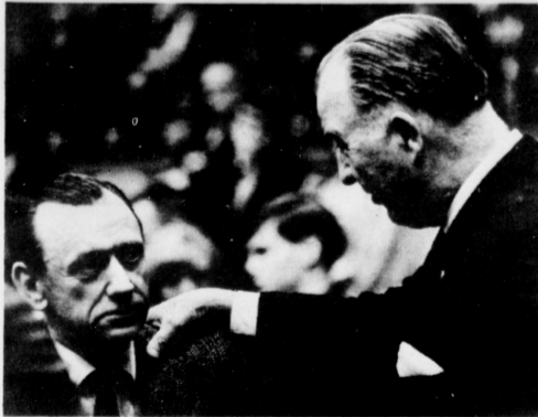
A. B. "HAPPY" CHANDLER IN A FAVORITE POSE