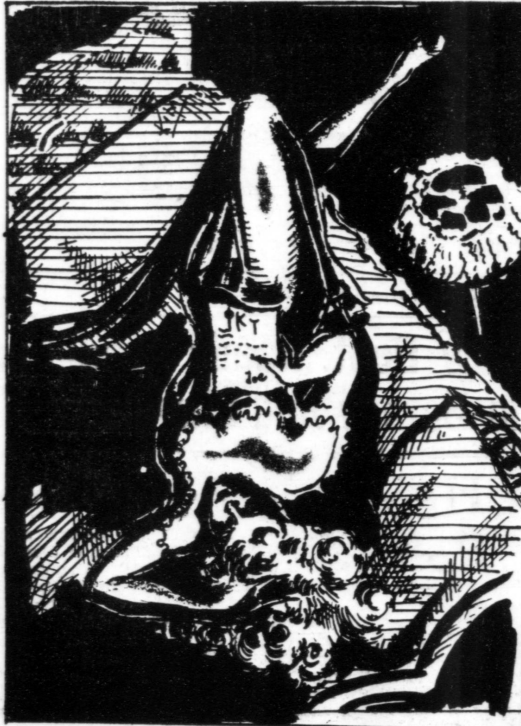
"... and we're going to pledge a fellow named Jones—'cause he knows more about our books than our treasurer."