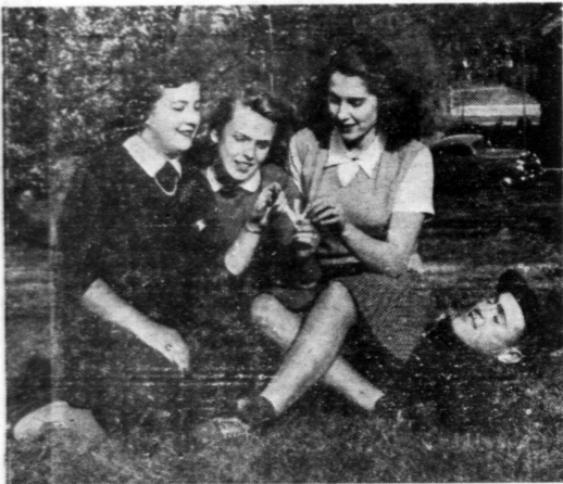
DEFENSE JOBS and the armed forces have taken so many young men from the campus, that co-eds find "dating" is one of their major problems. Three University co-eds (above) perch upon a hapless victim while they draw straws to see who gets him.