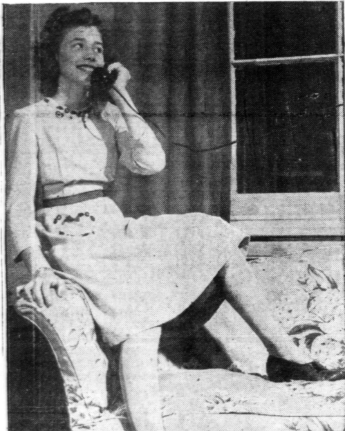
"DATES" PLAY AN IMPORTANT PART in the lives of most college girls, and this co-ed is no exception. Receiving a call as late as 8 p. m., she can blitzkrieg into a suitable outfit and be ready to go out by 8:15.