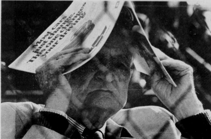
Cheer Up, We're Winning!

This football fan looks a bit disgruntled as he watches last Saturday's football game at Stoll Field. The sun may have been bothering him, but not the Wildcats, who defeated North Carolina State 27 to 2.