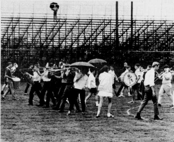
The Show Must Go On

And so it does . . . Through rain and shine the 1968 Wildcat Marching Band marches on. One band enthusiast braves the elements perched atop the Stoll Field stands to watch those below go through a complex drill.