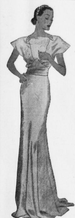
To the Christmas Party