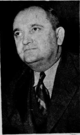
Coach Adolph Rupp . . .

. . . sees possibilities for a basketball team at Kentucky this year brightening.