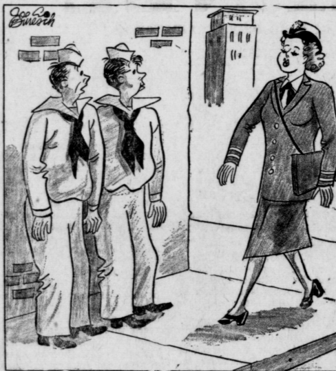
"Brrrr! Looks like a cold wave."