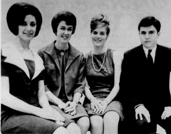
Heart Fund Drive Committee