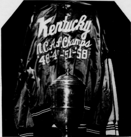
RES IPSA LOQUITUR