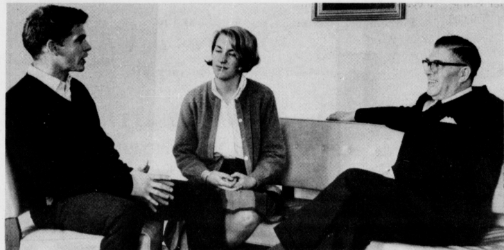
Students attend a special study program at the Baptist Student Union, close to campus.

© 1966, Max Shulman The makers of Personna® Stainless Steel Blades who sponsor this column—sometimes nervously—are also the makers of Burma Shave.® Burma Shave soaks rings around any other lather and is available in regular or menthol. Be kind to your kisser; try some soon.