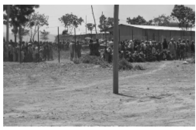
"On one mission, I, along with four physicians, two corpsmen and one physician assistant, saw and treated more than 1200 patients in three days."

We have already left a big footprint in the camp and region with the services and capabilities offered. We've seen a variety of inpatients including trauma, cardiac, orthopedic, urology,