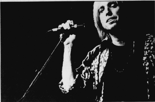
Tom Petty's new album, Echo , is a tribute to his enduring life in rock 'n' roll. The album will be supported by a tour starting in June.