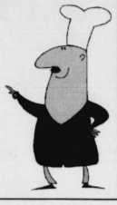
Proceeds to benefit Cardinal Hill Rehabilitation Center

will be on WEDNESDAY, APRIL 21 5:00-8:00 p.m. at the Kappa House on East Maxwell EVERYONE WELCOME! Dinner costs $4.00