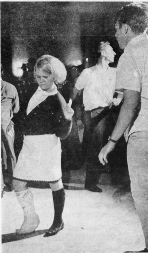
It's Worth A Try