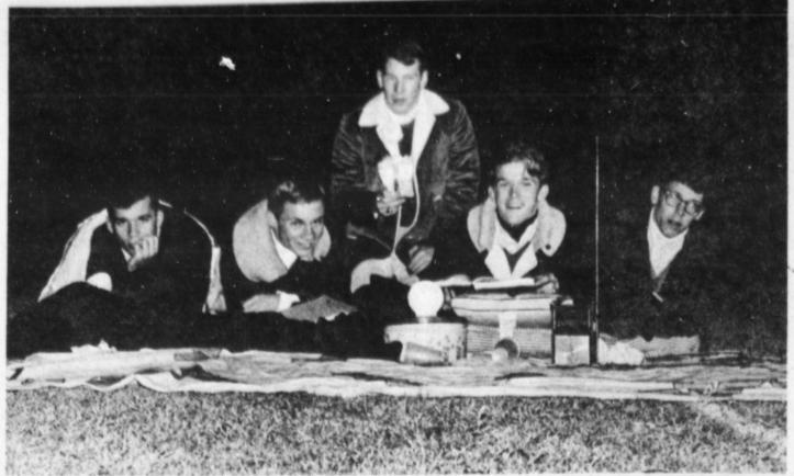
Five freshmen, despite freezing temperatures Friday night, slept out on the Stoll Field 50-yard line before the Homecoming game to show West Virginia that the Mountaineers would not cross

After completing their post-graduate studies, which may range from one to four years, the commissioned officer enters active duty as a second lieutenant.