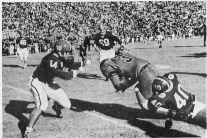
And The Wildcats Romped