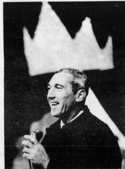
The King Don't Care

Saturday night at the Coliseum it was swing and sway with Sammy Kaye for the Homecoming Dance. And as the band's last notes faded so did the reality of Homecoming. After waiting for 100 years, it was all over.