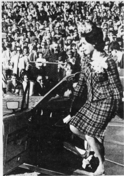
And If The Regal Slipper Fits . . .