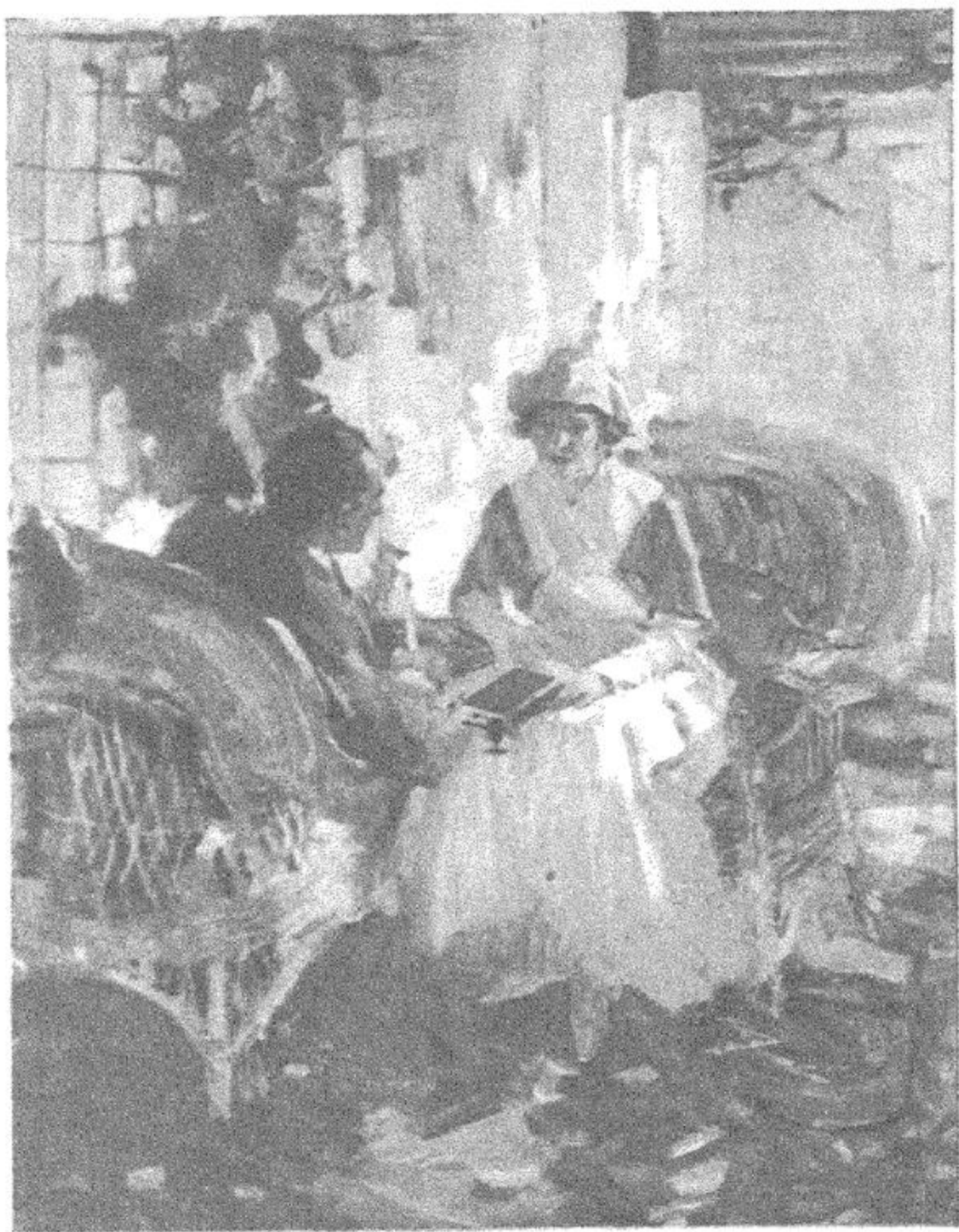
"The boy is infatuated with that girl."