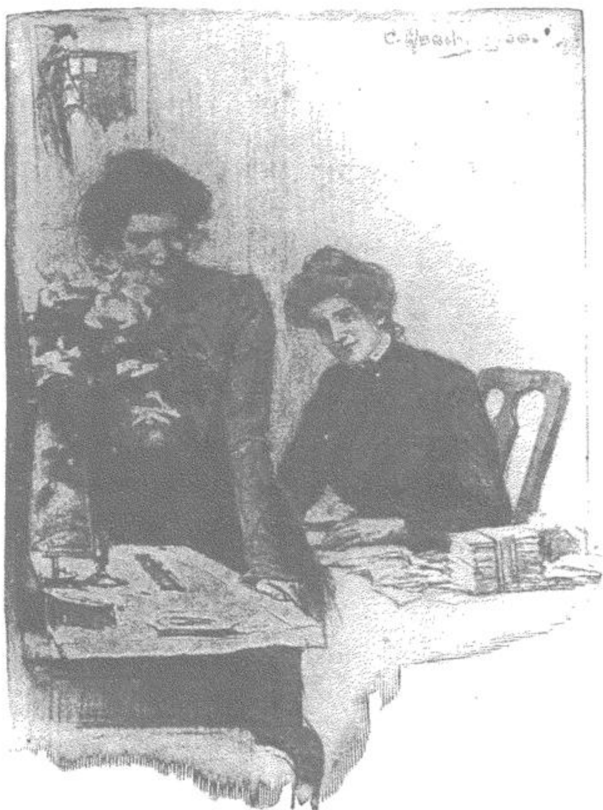
"HID HER FACE IN A GREAT BUNCH OF ROSES."