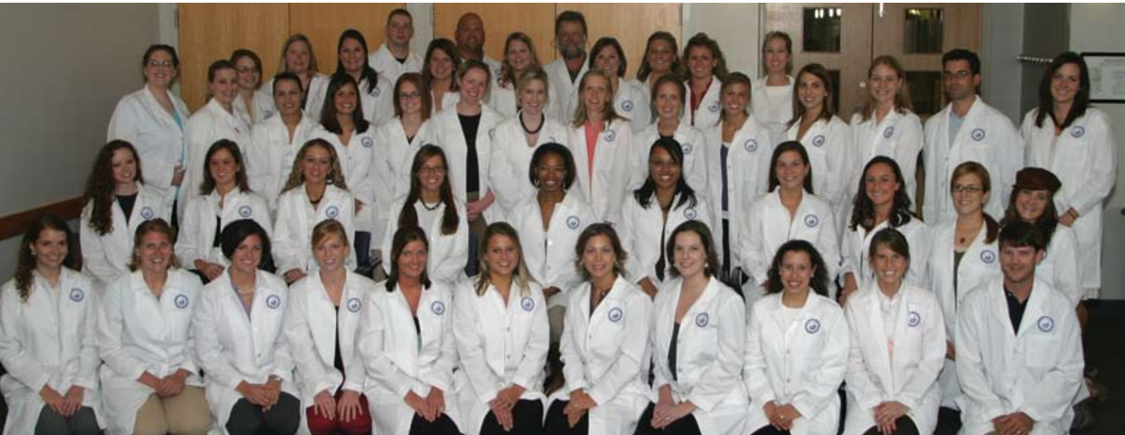
Top: May 2007 B.S.N. class Bottom: December 2007 B.S.N. class