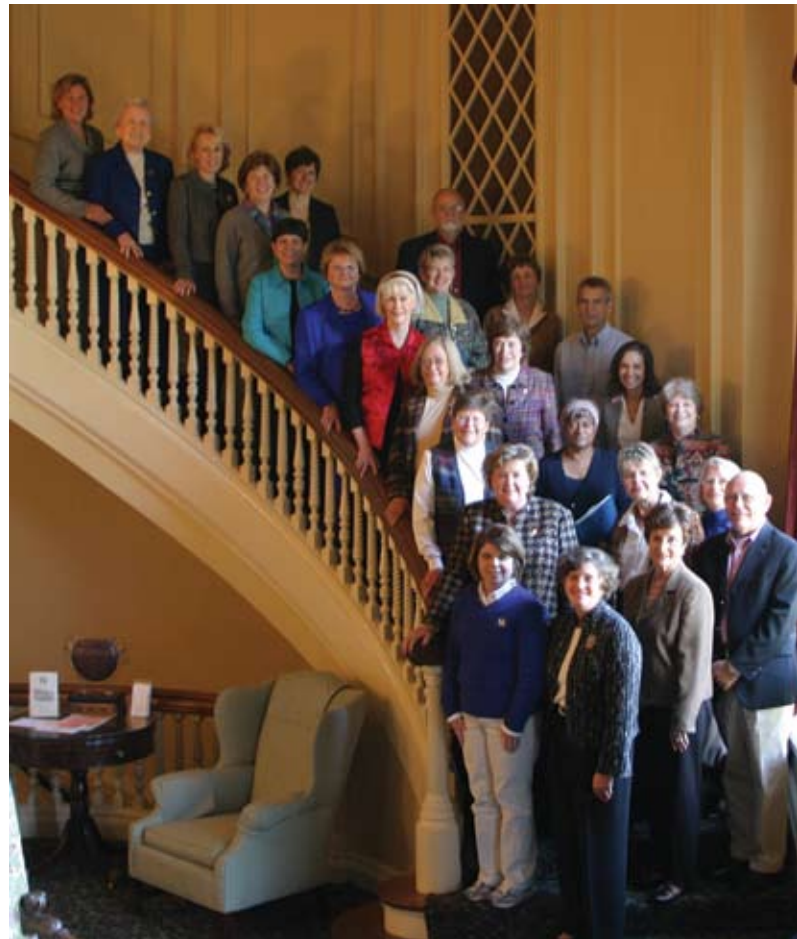
UK College of Nursing Advisory Council, fall 2007, at Spindletop